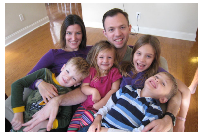
At Home in Durham, NC