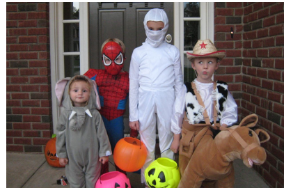
Elephant Spiderman Ninja Cowboy