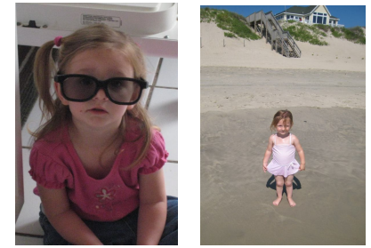
Lookin’ Cool Outer Banks