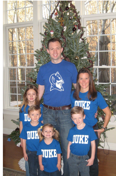
Bleeding Duke Blue for Christmas