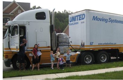
Moving to Durham, North Carolina