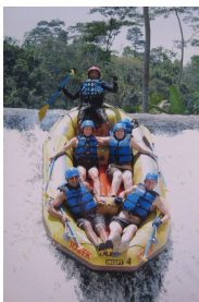
Telaga Waja, Bali