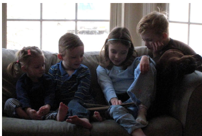
Reading to Her Siblings