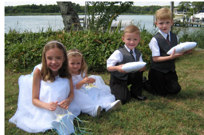
Flower Girls & Ring Bearers