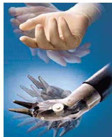
FIGURE 3. Advanced surgical robotic “hand” instruments mimic the movement and functionality of human hands and wrists in “open” surgery, allowing 6 degrees of freedom of motion.