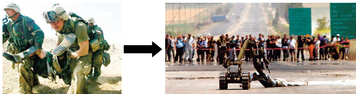
FIGURE 7. Current deployable medically relevant robotic capability. The next generation will not only recover the injured in a hostile environment, but also will be capable of diagnosis and limited treatment.

From a military perspective, robotic technology to project function into a hostile environment (combat, nuclear/chemical/biological) has clear applicability (Fig. 7). The daVinci surgical robotic system may not currently meet military deployment needs, but the modular, lightweight Zeus and Laprotek systems have the potential to project surgical expertise far forward. For example, the Aesop device, if connected to a telemedicine link, can offer the field surgeon capability to obtain consultation from a surgeon at one of the military's large, state-side medical centers, who could share the same field of view in real time. As robotic and telemedicine, even telesurgery, capabilities expand, surgical robotics could become a force multiplier and project surgical expertise either to the combat theater or to hostile (biological, chemical, nuclear, etc.) environments. Regarding the peacetime military medical core mission, surgical robotics may be able to enhance surgeon education and expertise, patient safety, and, when integrated with telemedicine, provide distant expert consultation to remote locations.