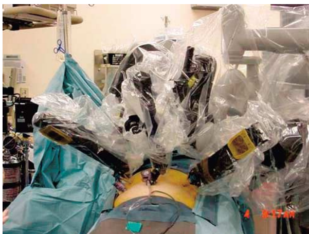
FIGURE 6. daVinci robot draped and positioned for clinical use. Robot platform is floor mounted and does not move with patient and table; thus, position is fixed once instruments are in place.

In urology, visualization and manipulation in the narrow, difficult-to-access male pelvis are severely limited, and thus minimally invasive approaches to radical prostatectomy have been employed by only a handful of expert videoendoscopic urologic surgeons. Surgical robotics, with three-dimensional visualization and precise, flexible instruments extends the laparoscopic urologist’s skills to enable routine robotic-assisted laparoscopic radical prostatectomy. Dr. Mani Menon (who does not claim to be a laparoscopic surgical guru) performs up