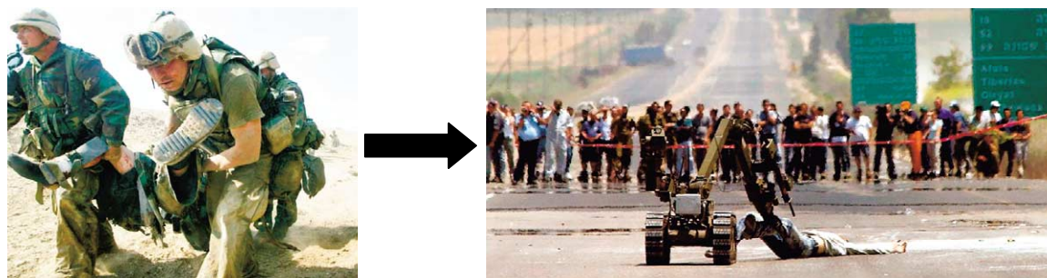
FIGURE 7. Current deployable medically relevant robotic capability. The next generation will not only recover the injured in a hostile environment, but also will be capable of diagnosis and limited treatment.

From a military perspective, robotic technology to project function into a hostile environment (combat, nuclear/chemical/biological) has clear applicability (Fig. 7). The daVinci surgical robotic system may not currently meet military deployment needs, but the modular, lightweight Zeus and Laprotek systems have the potential to project surgical expertise far forward. For example, the Aesop device, if connected to a telemedicine link, can offer the field surgeon capability to obtain consultation from a surgeon at one of the military's large, state-side medical centers, who could share the same field of view in real time. As robotic and telemedicine, even telesurgery, capabilities expand, surgical robotics could become a force multiplier and project surgical expertise either to the combat theater or to hostile (biological, chemical, nuclear, etc.) environments. Regarding the peacetime military medical core mission, surgical robotics may be able to enhance surgeon education and expertise, patient safety, and, when integrated with telemedicine, provide distant expert consultation to remote locations.