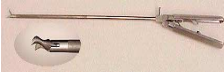
FIGURE 1. Laparoscopic instruments: modified “chop sticks” with poor ergonomics and limited degrees of freedom of motion, precision, and tactile feedback.

gery, but all of surgery. Laparoscopic cholecystectomy was accepted as “standard of care” by 1992, just 5 years after its introduction. 2,3 By the same year, laparoscopic approaches had already been used to perform solid organ removal and anti-reflux, colon, urologic, thoracic, and trauma procedures. Now, 10 years later, minimally invasive surgery impacts all surgical specialties.