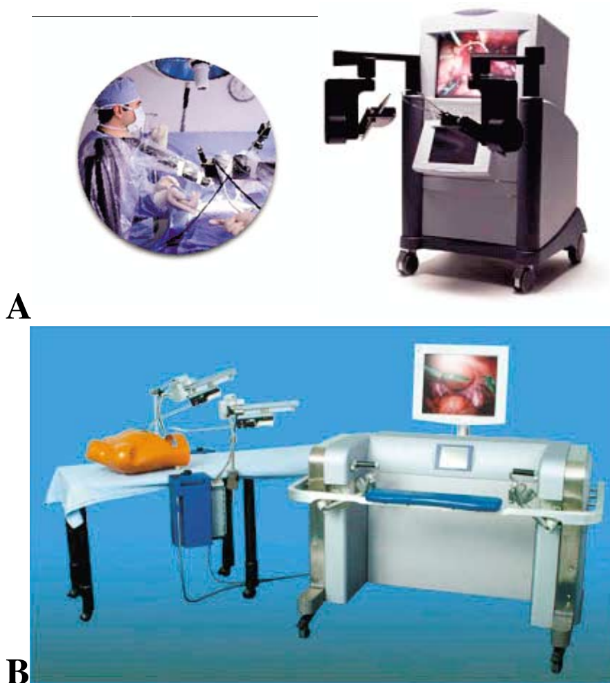
FIGURE 4. (a) Zeus and (b) Laprotek surgical robotic systems: lightweight, table-mounted, modular robotic arms (left) and surgeon consoles (right).

Laprotek is being developed in Boston, Massachusetts, by endoVia. This system still requires regulatory clearance by the FDA, but it hopes to be commercially available sometime in 2004. Although the three systems differ significantly and possess distinct strengths and weaknesses, they share a basic common framework—three components: surgeon console, robot platform, and camera equipment tower.