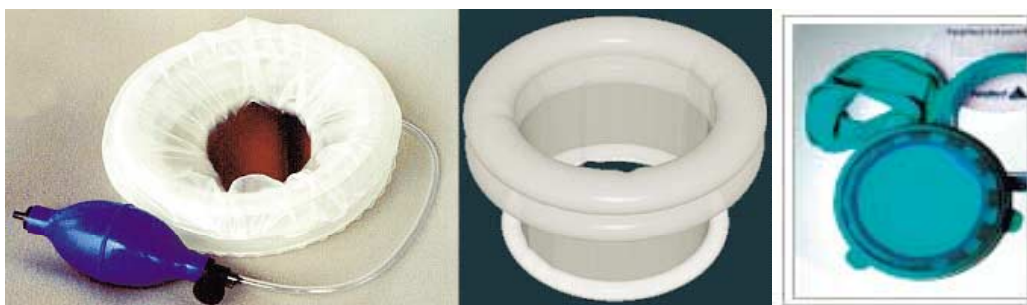
FIGURE 2. “Low tech” solutions to enhancing laparoscopic surgery skills: hand-assist devices.

three-dimensional vision. The enabling developments in the last 45 years derive from breakthroughs in computer science. Beginning with the Eniac computer in 1946, then William Shockley’s transistor in 1947, the integrated circuit in 1959, and the microprocessor in 1971, integrating these technologies laid the foundation for the first commercial surgical robotic device, Aesop (Computer Motion, Sunnyvale, CA, 1994), a voice-activated system that controls movement of the laparoscopic camera. The engineering solution to current laparoscopic “chop sticks” is in miniaturized, articulating, remote-controlled laparoscopic instruments. Add development of three-dimensional vision, and the cumulative solution is an integrated surgical robotics system.